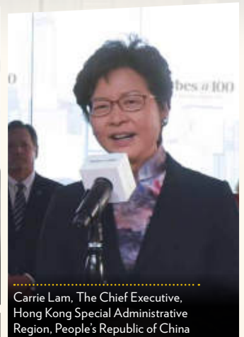
Carrie Lam, The Chief Executive, Hong Kong Special Administrative Region, People's Republic of China