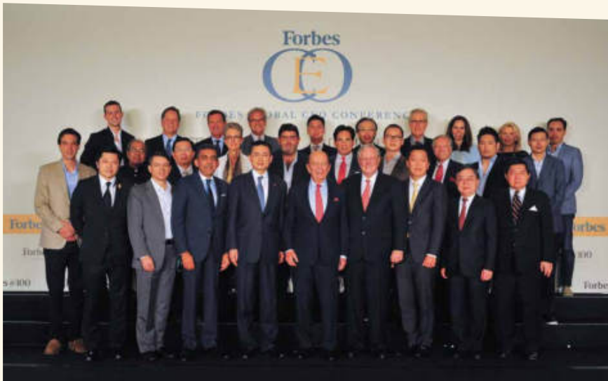
■ Speakers at the Forbes Global CEO Conference

As Forbes enters its second century, the conference looked forward to what lies ahead. Gathering some 490 of the world's top visionaries, CEOs, tycoons and investors, the conference provided a high-level platform to discuss and evaluate how far the global community has come, what needs to be done, and where it is going next.