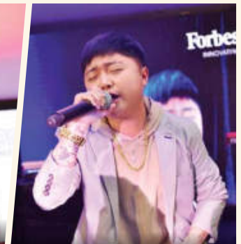
Jake Zyrus (formerly known as Charice)