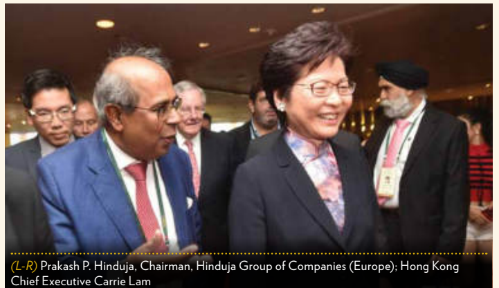
(L-R) Prakash P. Hinduja, Chairman, Hinduja Group of Companies (Europe); Hong Kong Chief Executive Carrie Lam