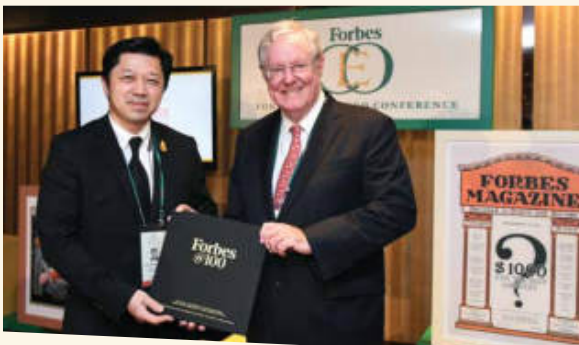
■ (L-R) Suphachai Chearavanont, CEO, Charoen Pokphand Group, Chairman of the Executive Committee, True Corporation; Steve Forbes, Chairman & Editor-in-Chief, Forbes Media