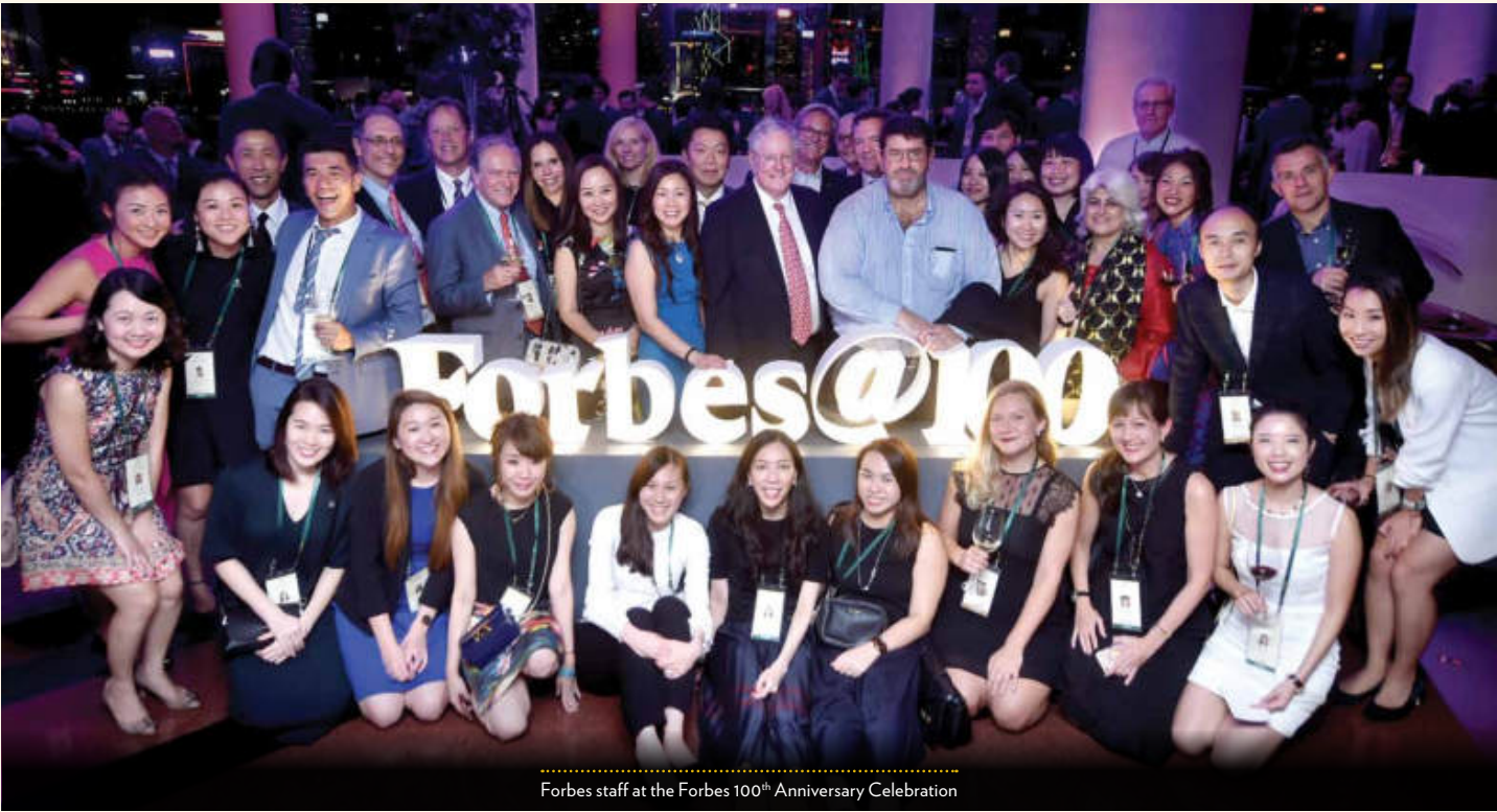
Forbes staff at the Forbes 100 th Anniversary Celebration

A special thanks to the speakers, delegates and sponsors of the seventeenth Forbes Global CEO Conference.