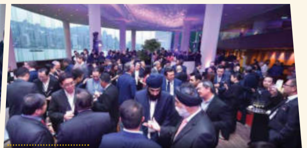
Delegates networking at the reception