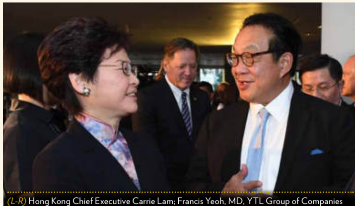
(L-R) Hong Kong Chief Executive Carrie Lam; Francis Yeoh, MD, YTL Group of Companies