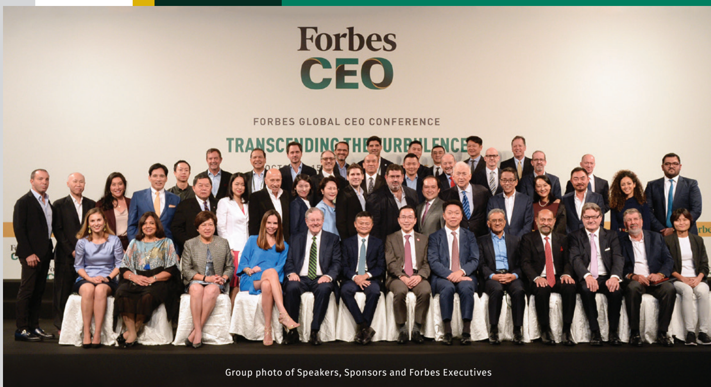
Group photo of Speakers, Sponsors and Forbes Executives