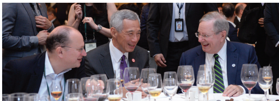
(L-R) Mark E Tucker, Group Chairman, HSBC Holdings; Prime Minister Lee Hsien Loong; Steve Forbes