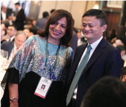
(L-R) Kiran Mazumdar-Shaw, Chairperson & MD, Biocon; Jack Ma